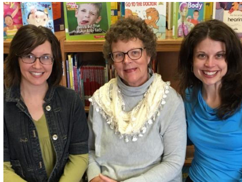
MPSD's School Nurse Team

The Manitowoc Public School District focuses on supporting the whole child, including students' social-emotional health. To bolster this effort, MPSD created a new full-time position of Mental Wellness Coordinator starting in the 2017-18 school year, and hired an additional full-time school counselor.